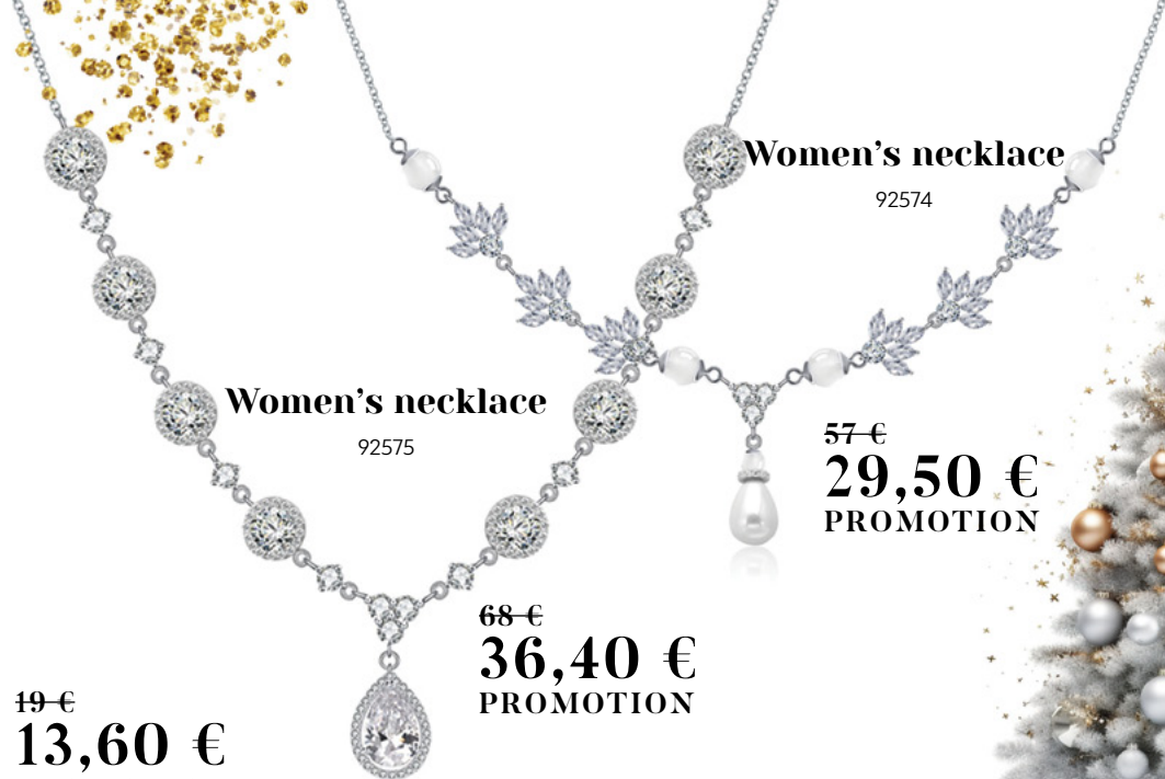
Women's necklace 92575