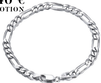
Men's bracelet 92906