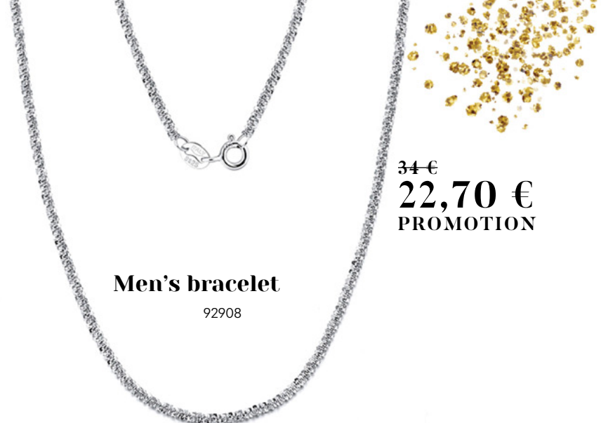
Men's bracelet 92908