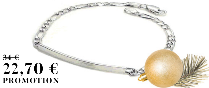
Men's bracelet 92806